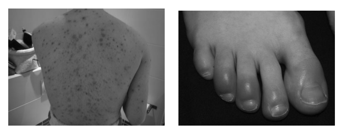
Figure 3. Vesicular rash.

chilblain-like lesions, were the most common dermatologic manifestations encountered in CoVID-19 patients (Daneshgaran et al., 2020; Gisondi et al., 2020). These findings have been coined by some as "CoVID toes" and may be encountered in patients with no other symptoms and are usually late presentations in mild cases of CoVID-19 (Ladha et al., 2020; Seirafianpour et al., 2020). Based on several reports, CoVID-19 chilblains are usually asymmetrical, are more common in younger patients, and mainly affect the feet (Daneshgaran et al., 2020; Gisondi et al., 2020; Ladha et al., 2020). Unlike typical chilblains, it is thought that CoVID-19 chilblains are less likely the result of ischemia or thrombosis (Ladha et al., 2020; Seirafianpour et al., 2020). Furthermore, it