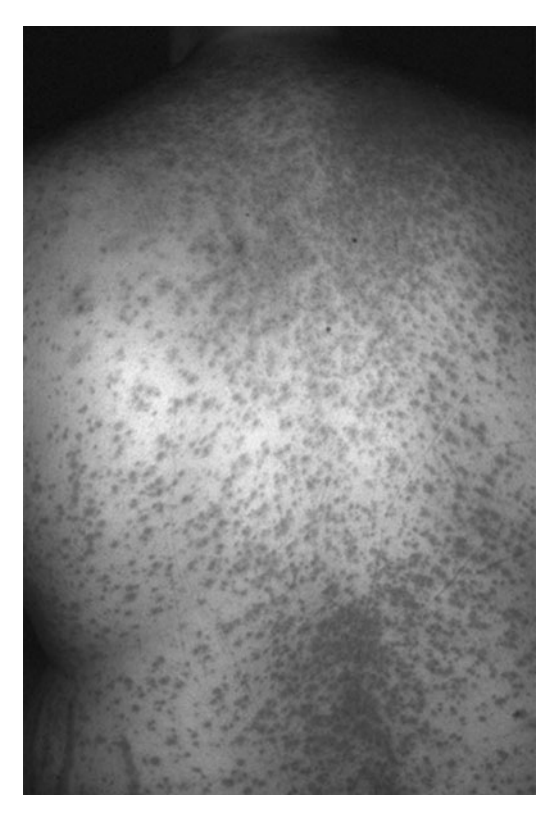
Figure 1. Maculopapular rash.

According to Sachdeva et al. (2020) and Seirafianpour et al. (2020), the most common rash reported was a maculopapular rash (see Figure 1), sometimes referred to as a mor-