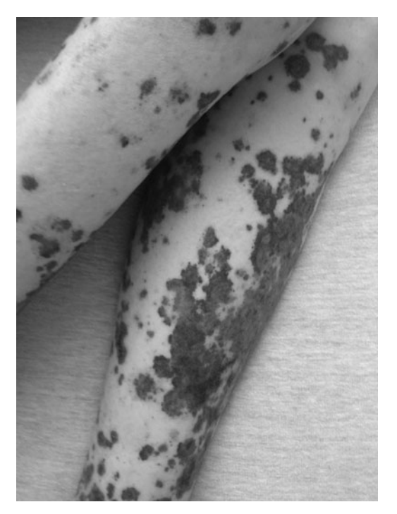
Figure 7. Petechial rash.

Even with a positive SARS-CoV-2 test, other differentials should be considered for dermatological findings. These may include autoimmune conditions such as lupus, vasculitis, environmental exposures, other viral pathogens, for example, herpes simplex and herpes zoster, medications, and malignancy to name a few (Ladha et al., 2020; Seirafianpour et al., 2020). Treatment for these dermatological changes associated with CoVID-19 is usually supportive. Topical steroids may be used to provide antiinflammatory benefits, though this is not proven in CoVID-19 patients (Ladha et al., 2020). Pruritus may be treated with anti-