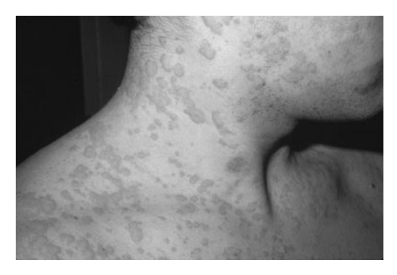
Figure 2. Urticarial rash.

billiform rash. This rash may be classic in presentation, as seen with measles, or may be in large plaque formations (Gottlieb & Long, 2020). Urticarial rashes (see Figure 2) were also commonly reported with most being located on the trunk with associated pruritus (Gottlieb & Long, 2020). Vesicular rashes (see Figure 3) have also been reported, some cases had a similar appearance and distribution such as varicella, and others were more monomorphic and had hemorrhagic characteristics (Gottlieb & Long, 2020).