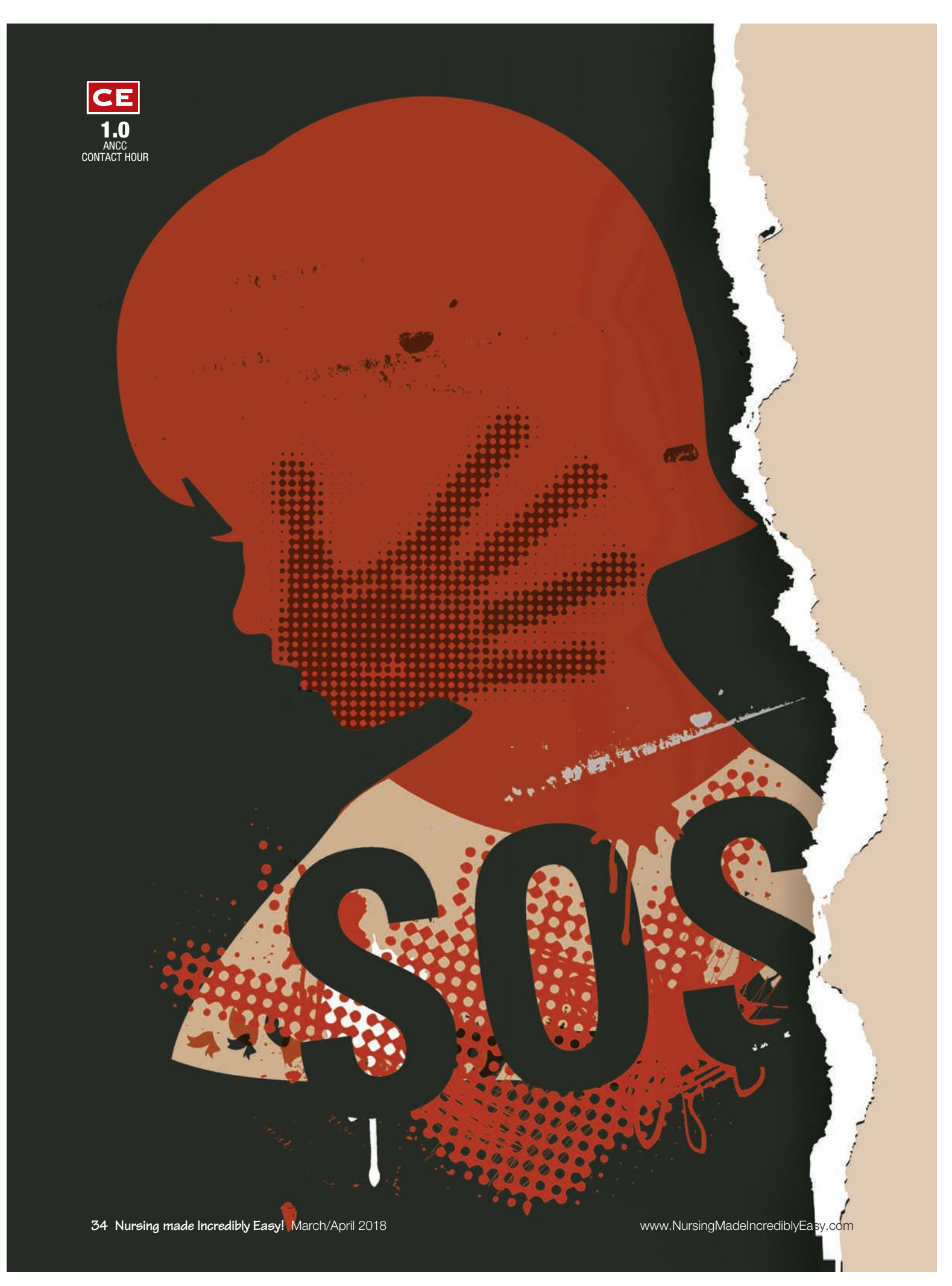
Copyright © 2018 Wolters Kluwer Health, Inc. All rights reserved.