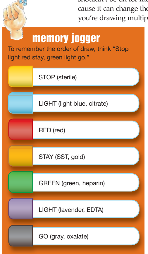
38 Nursing made Incredibly Easy! July/August 2016

Place gauze lightly over the site just before withdrawing the needle so that when you remove the needle, you can apply immediate pressure. At this point, you may ask the patient to hold pressure with the gauze. If the patient is unable, then you must complete this step. Hold the pressure for at least 2 minutes. If the patient is