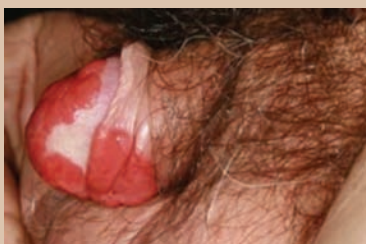
Erythroplasia of Queyrat (EQ) is SCC in situ of the glans.