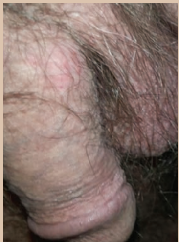
This example of Bowen disease (BD) shows SCC in situ on the lower left shaft. The lesion is subtle, discrete, dull-red, and slightly raised.

Questions that the nurse should ask during the health history interview include: