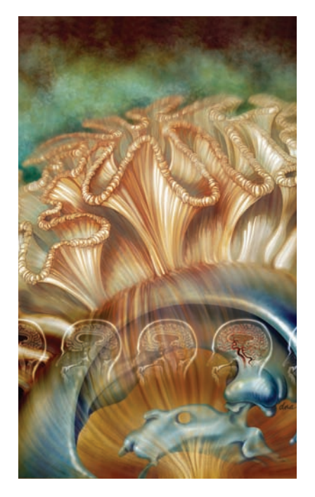
Overdrainage of CSF is a common and potentially serious complication of VP shunting, particularly in the first year.

Possible complications of VP shunt placement include infection of the shunt catheter, intracerebral hematoma, seizures, and shunt