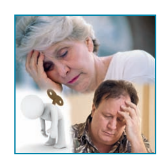
Dexamethasone a Potential Treatment for Cancer-Related Fatigue p.31