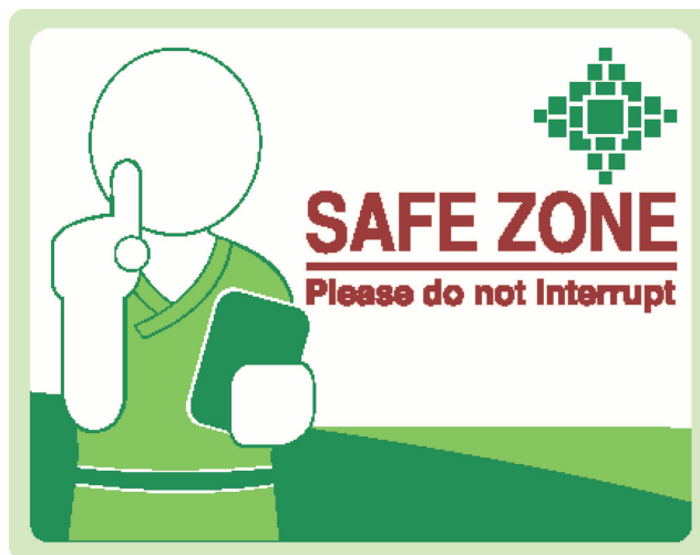
Figure 1 Sign used to designate Safe Zones. Floor-level signage.

A project team, consisting of 6 influential leaders representing all key stakeholders, assisted with implementation and evaluation.