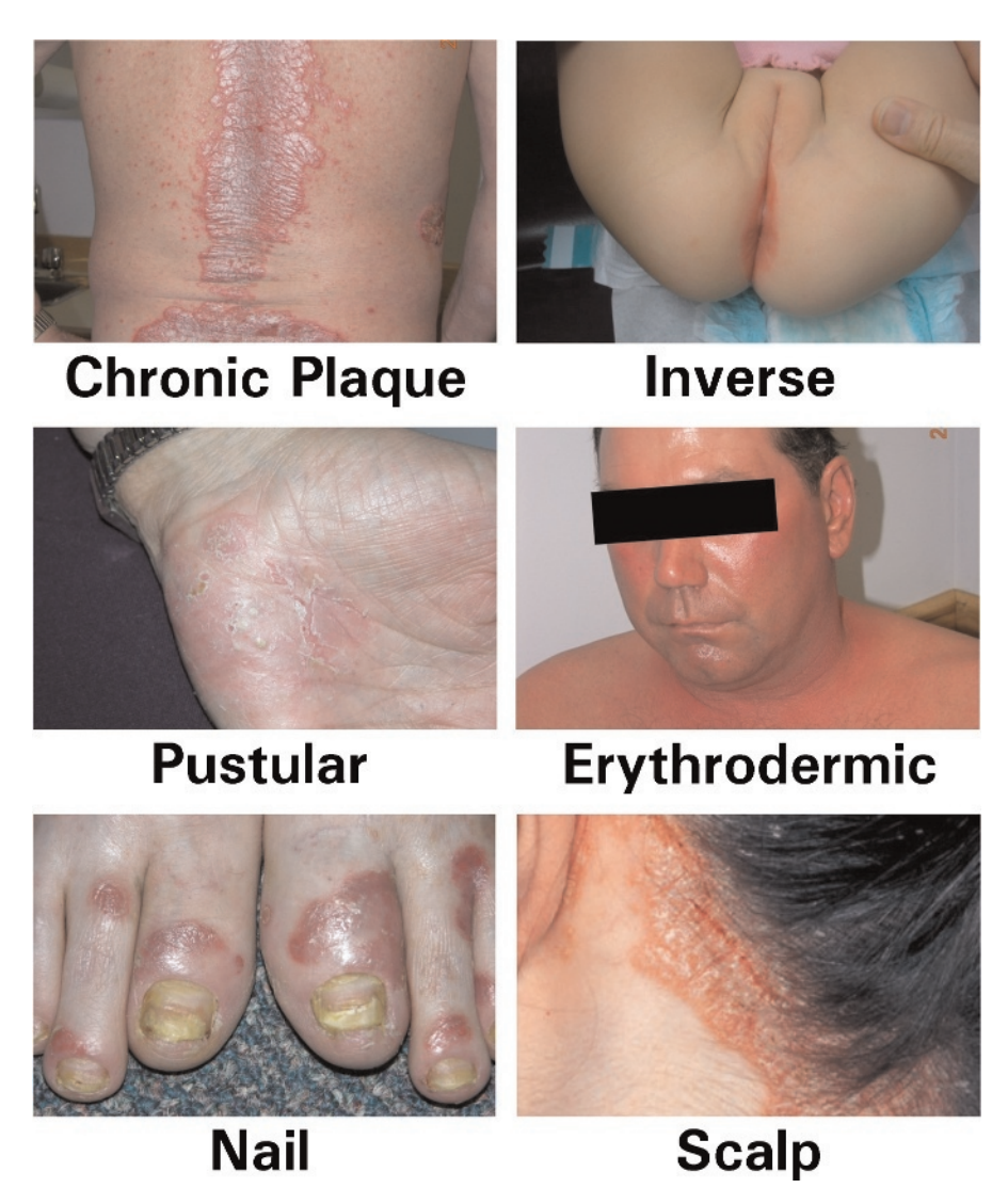
Figure 2. SKIN, NAIL, AND SCALP INVOLVEMENT WITH PSORIASIS VULGARIS

keratolytic agents that break down scale (urea, salicylic acid, \alpha -hydroxy acid), and emollient moisturizers (Table 1). The choice of topical agent depends on anatomical area, size and thickness of the plaque, and whether the agent is being used for initiation or maintenance therapy.