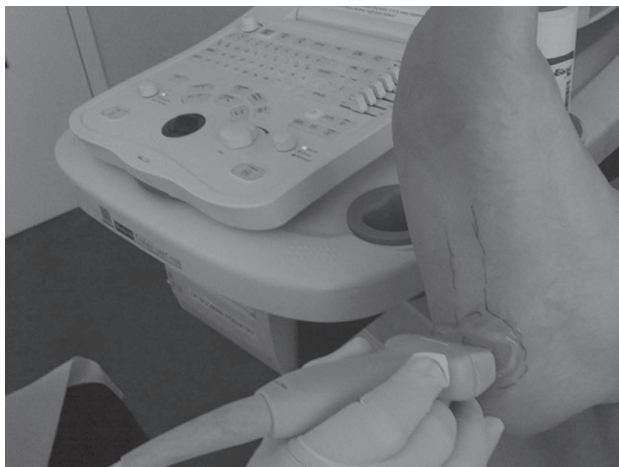
FIGURE 2. Ultrasound of plantar fascia performed in office.

with symptomatic plantar fasciitis, it is becoming a general consensus that the pain associated with plantar fasciitis has a weak, if any, correlation to the presence of heel spurring (Healey & Chen, 2010; Toomey, 2009). This belief brings criticism to the widely accepted synonymy between plantar fasciitis and “heel spur syndrome,” which now appears to be quite misleading. Other radiographic findings that can be seen with heel pain are bone tumors, bone cysts, periostitis, and erosions due to infection of rheumatologic causes (Healey & Chen, 2010).