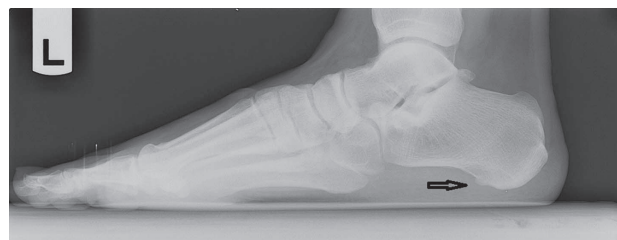
FIGURE 1. Lateral radiograph with small calcaneal spur.

Radiographs are a valuable tool in ruling out acute osseous abnormalities that cause heel pain such as calcaneal stress fractures (Lawrence et al., 2013). A lateral radiograph of the foot (see Figure 1) to assess soft tissue changes should be the first choice if imaging is desired (McPoil et al., 2008). Radiographs can identify a pronated foot type (i.e., pes planus), which has been shown to correlate with chronic heel pain (Irving, Cook, Young, & Menz, 2007). Routine radiographs have been shown to provide no real benefit in diagnosis or treatment in patients with plantar heel pain (Levy, Mizel, Clifford, & Temple, 2006) unless an unusual presentation such as a positive heel squeeze test or history of trauma is noted (Toomey, 2009). As is common with stress fractures, radiographs are limited in their ability to identify fractures in the early stages as fracture lines may not be evident for several weeks. An MRI or bone scan would likely be indicated at this point. Radiographic evidence of heel spurring along the plantar aspect of the calcaneal tuberosity is a prospective finding in patients with plantar fasciitis (see Figure 1). Although there is a slightly increased incidence of heel spurs in patients