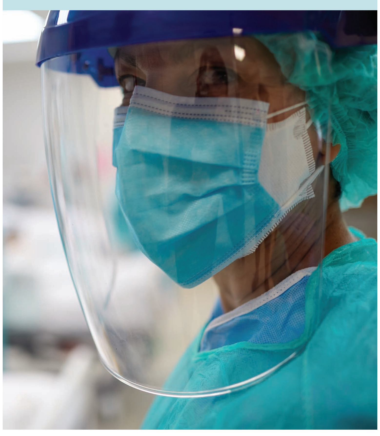
Copyright © 2022 Wolters Kluwer Health, Inc. All rights reserved.