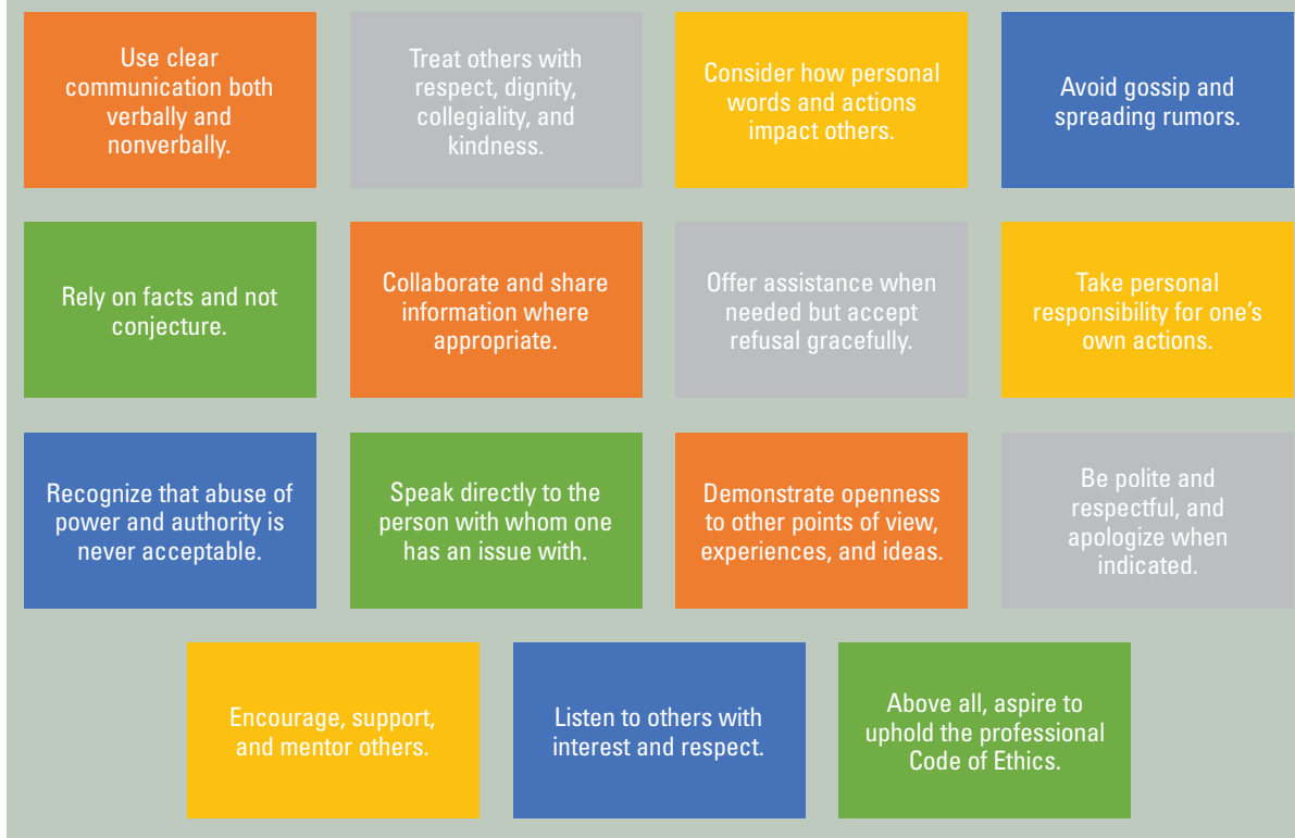
Figure 2: ANA Civility Best Practices for Nurses 4

(ANA) Civility Best Practices for Nurses provide guardrails for interactions and behavior on the unit. 4 (See Figure 2 .) Employing these best practices helps create a culture of inclusiveness, especially when all staff members are empowered to speak up for any reason.