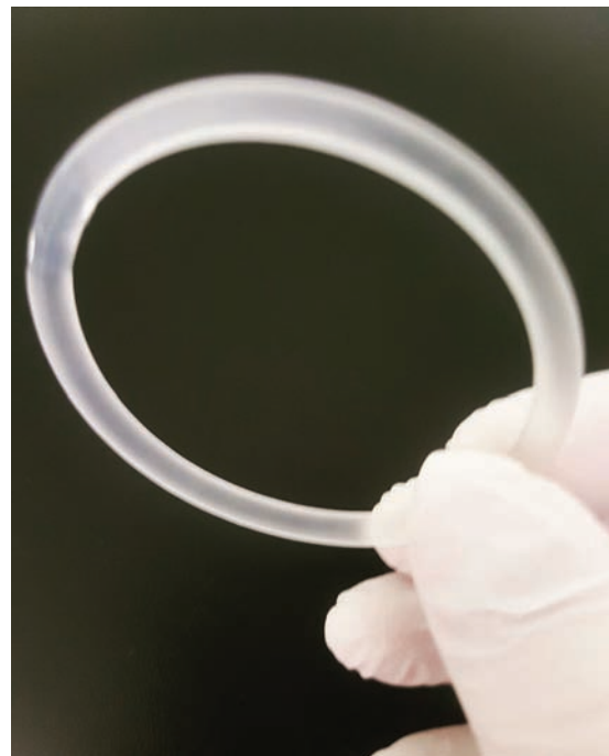
Figure 3. The Vaginal Ring

Progestin-only pills (POPs). POPs are generally made with first-generation progestins, and dosage amounts are substantially lower than those found in any CHC. Like CHCs, POPs should be taken at the same time of day. They are used continuously, with no hormone-free interval. Despite their pharmacokinetic differences, failure rates are often reported together: Hatcher and colleagues report that for both types of pills, the failure rate is less than 1% with perfect use and 7% with typical use. 9 That said, POPs have a higher failure rate when not taken at the same time every day, because effective drug levels are maintained in the bloodstream for only 22 hours. 9 Nurses should caution patients that