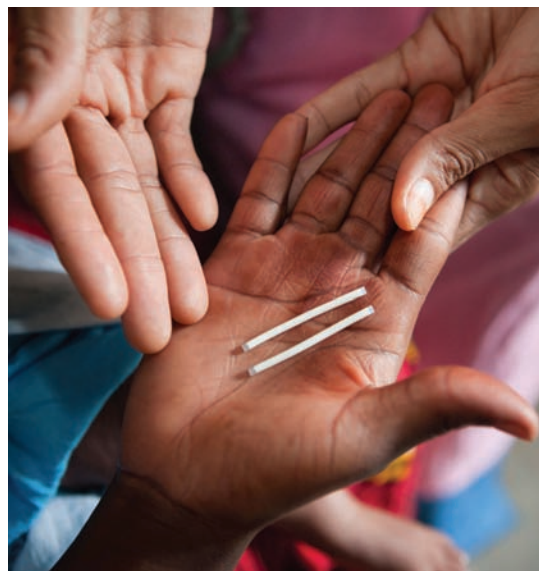
Figure 4. The Single-Rod Implant

The single-rod implant (Implanon, Nexplanon), which is about the size of a matchstick, is inserted in the upper arm and can remain in place for up to three years (see Figure 4). The implant contains 68 mg of etonogestrel that is released incrementally at slowly diminishing rates, from 60 to 70 mcg/day initially to 25 to 30 mcg/day by the end of the third year. 31 Failure rates with both typical and perfect use are below 1%. 9 The most commonly reported reasons for discontinuation include irregular bleeding (10%), emo-