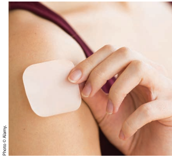
Figure 2. The Transdermal Patch