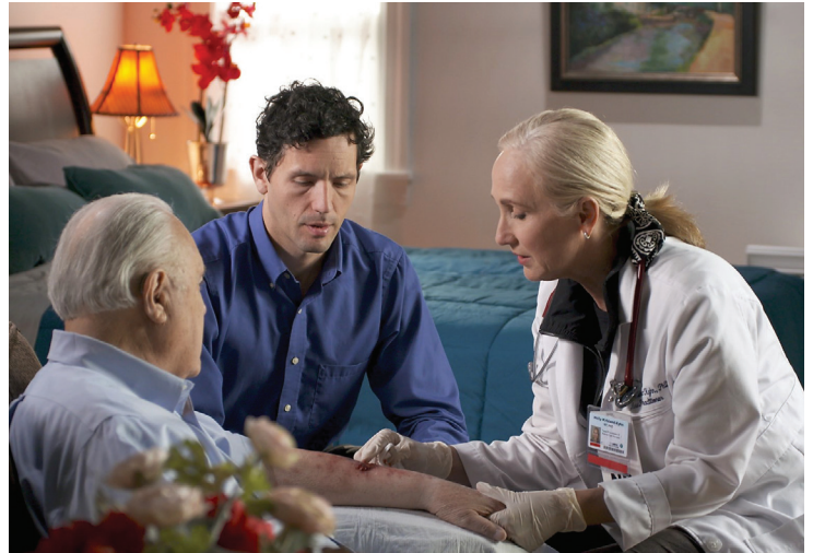
A nurse teaches the family caregiver how to assess and treat a skin tear.

Pressure injuries, which are also known as decubitus ulcers or bed sores, are injuries to skin or underlying tissue that result from sustained pressure, shear, and other factors. 10,11 Although often found over bony prominences, they can occur in any anatomical location. Pressure injuries present in a variety of ways, ranging from intact skin with nonblanching erythema to full thickness tissue loss down to the muscle or bone. 10,11 These wounds can develop because of impaired mobility or the use of medical devices, such as tracheostomy neck plates, wheelchairs, or orthopedic