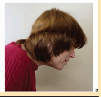
Louis ED, Mayer SA, Rowland LP. Merritt's Neurology. 13th ed. Philadelphia, PA: Wolters Kluwer Health and Pharma, LWW; 2015.

difficulty chewing food. Weakness in the lips, tongue, and pharyngeal muscle may cause difficulty swallowing, making the patient susceptible to choking. 15-19 Regurgitation of food and fluids through the nose indicates palatal muscle weakness. 15-19 Neck muscle weakness may cause difficulty balancing the head and create problems swallowing, breathing, and ambulating. Muscles of the arms, hands, fingers, legs, and for breathing are involved in generalized MG. 15-19 Patients may have difficulty performing activities of daily living, including opening a jar, hanging laundry, toileting, bathing, moving from sitting to standing, and walking. They may experience a feeling of profound heaviness when the arms and legs are affected. 15-19 Muscle atrophy and immobility contribute to weakness, fatigue, and environmental safety issues. 15-19 Myasthenic crisis (MC) and cholinergic crisis (CC) may occur when there are imbalances