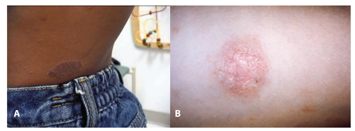
Figure 3. A herald patch, indicating pityriasis rosea, on a patient with dark skin tone (A) and light skin tone (B).

reveal discomfort and edema that should prompt further examination.<sup>19</sup>