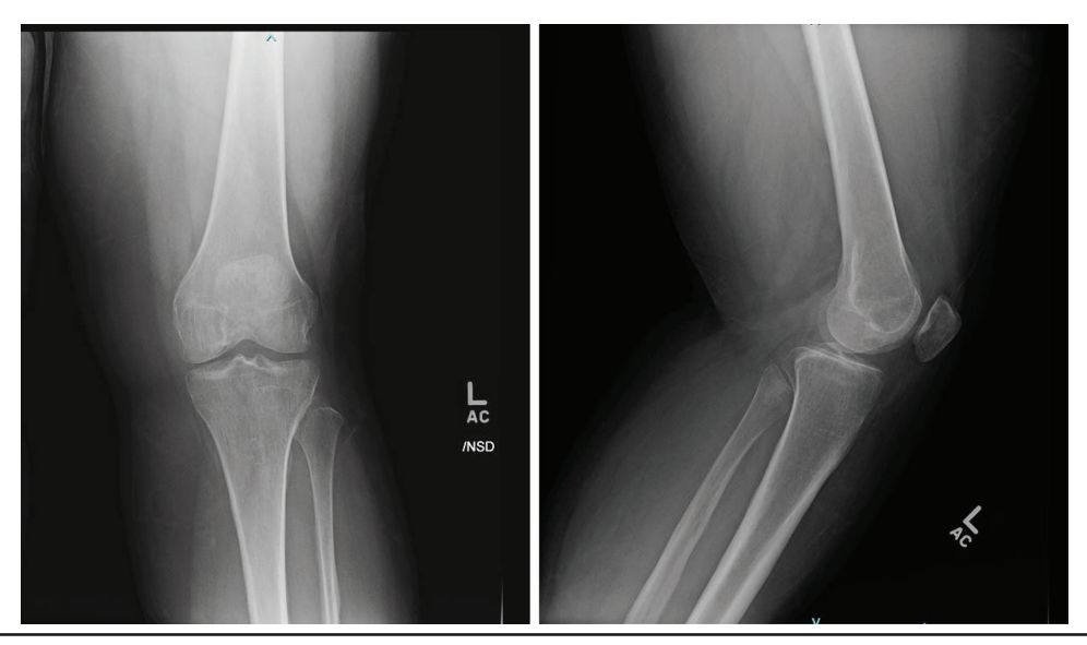
FIGURE 4. Two-month follow-up radiographs—Improved lucency of the lateral femoral condyle without evident cortical disruption.