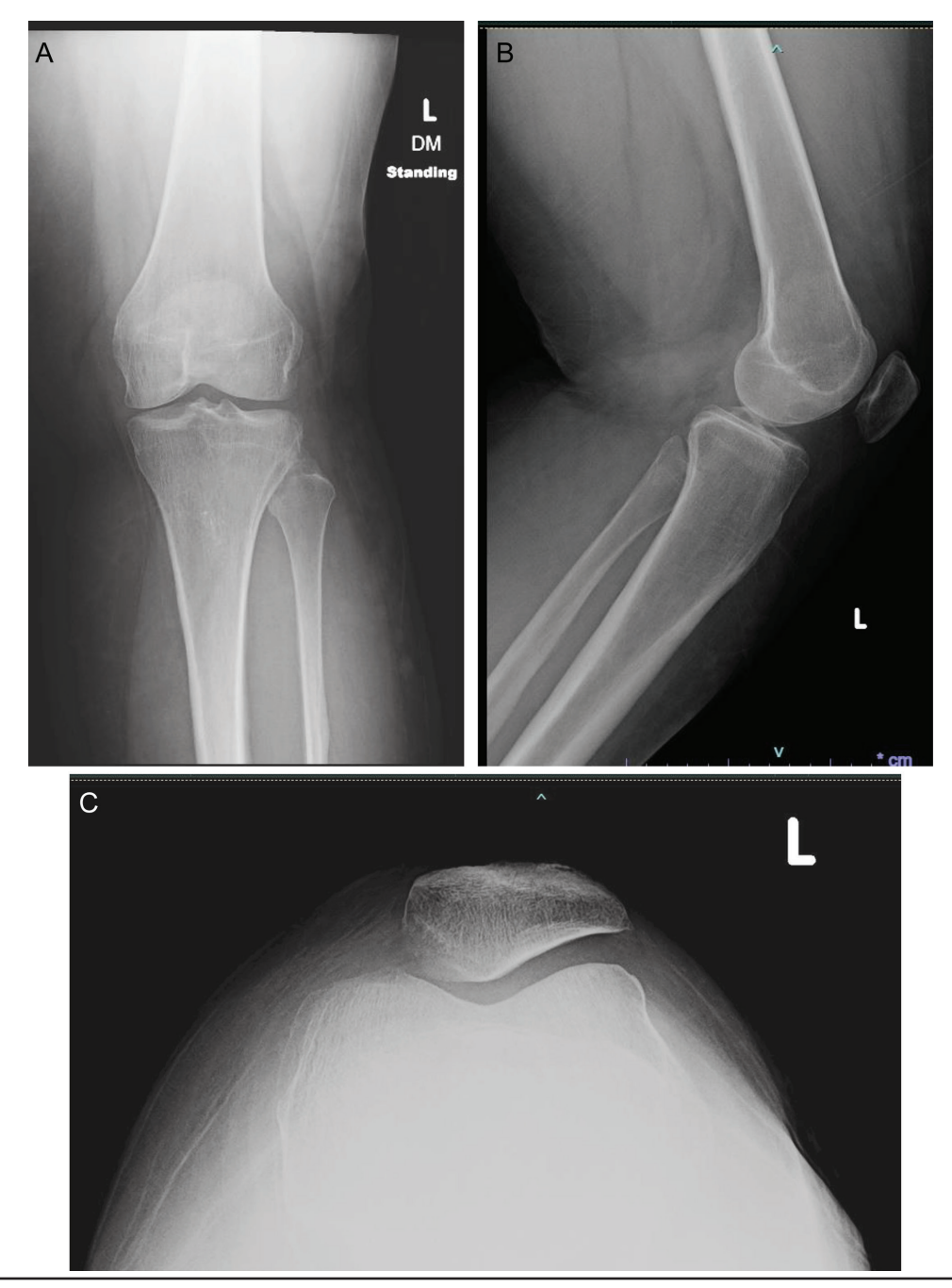
FIGURE 1. Left knee radiographs—anteroposterior, lateral, and sunrise views—No evident fracture or dislocation.

crutches, having almost fallen a couple of times. With that, she was fitted for a walker and instructed on continued protected weight-bearing. Pain medication was refilled. She was also referred for dual-energy x-ray absorptiometry (DEXA), which showed bone density consistent with osteopenia. It was recommended that she start a supplement with calcium and vitamin D and was given a referral to endocrinology. She was also given information for a smoking cessation program and discussed the importance of avoidance of all nicotinecontaining products. She confirmed her intent to quit.