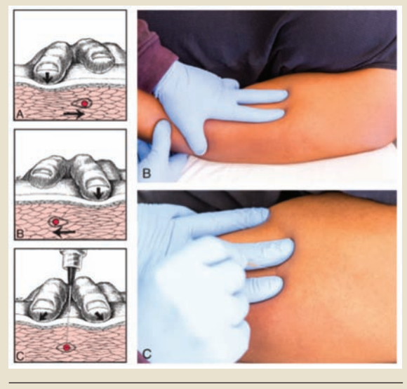
Abbreviation: TrP, trigger point. Source: Donnelly JM, Fries LM, Cicchetti CS, Fernández de las Peñas C. Trigger Point Injection and Dry Needling. In: Donnelly JM, Fernández de las Peñas C, Finnegan M, Freeman JL, eds. Travell, Simons & Simons' Myofas cial Pain and Dysfunction: The Trigger Point Manual. 3rd ed. Philadelphia, PA: Wolters Kluwer; 2019:760.

Cross-sectional schematic drawing of flat palpation to localize and hold the TrP (dark red spot) for TrP injections or dry needle. A and B , Use of alternating pressure between two fingers to confirm the location of the palpable TrP. C , Positioning of the TrP halfway between the fingers to keep it from sliding to one side during the needling.